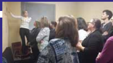
ICADV held trainings to help advocates learn more about rape prevention.