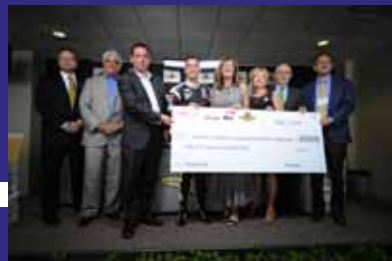
Officials from Verizon Wireless, IndyCar, Penske Racing and the IMS presented a $50,000 check to ICADV for survivor emergency transportation funds.