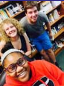
Members of the ICADV Youth Council have been blogging about respectful relationships on their website, Stand4Respect.org