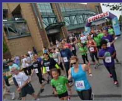
More than 700 people gathered on June 6, 2014 to raise funds at the Race Away from Domestic Violence in downtown Indy.

Technical service is an important ICADV service. This year we provided our member programs with help to write and manage grants, develop programs and handle difficult client issues. We also advocated on behalf of our programs and afforded them emergency transportation and lodging assistance for survivors.